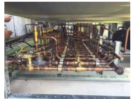
REFRIGERATION CIRCUITS (BELOW A CONDENSER OF A LINK+)