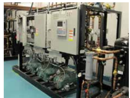
3 COMPRESSOR RACK